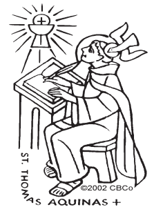
Saturday • January 28

10:45am RCIA for Adults 1:30pm CFF 3:00pm CFF 6:30pm Youth Ministry