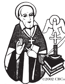
St Francis de Sales Tuesday • January 24 th